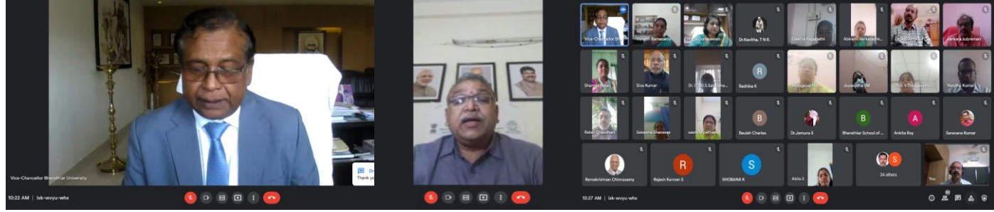
Chairman MGNCRE addressing the participants